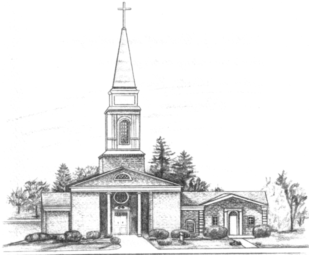
St. Paul United Methodist Church Christiansburg, Virginia