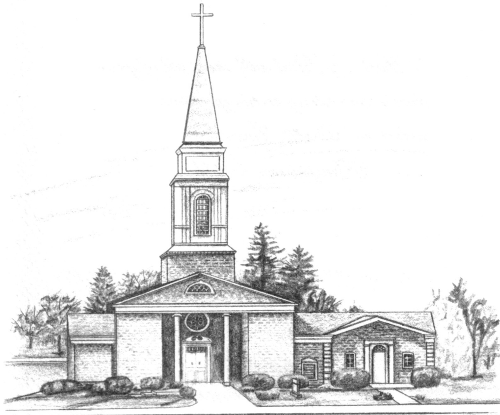
St. Paul United Methodist Church Christiansburg, Virginia

Phone: 540-382-2410 E-mail: info@stpaulvaumc.org Web: www.stpaulvaumc.org